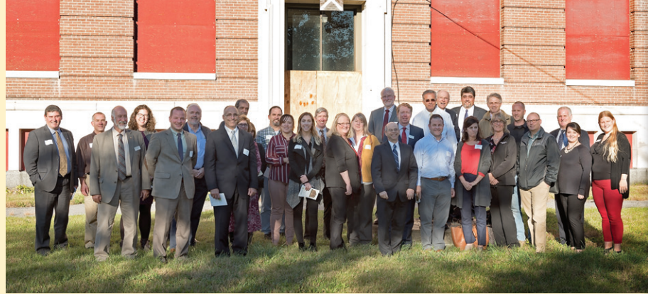
CITC Donor Appreciation Event at the former Carter Junior High School in Leominster

NewVue Communities redevelops problem properties into housing for working families. We buy properties that blight neighborhoods and turn those liabilities into assets.