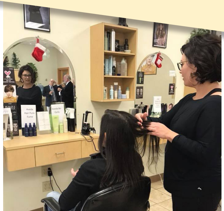
Rituals Salon & Spa ribbon cutting in Leominster.