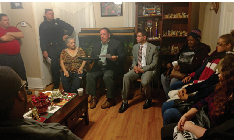
Residents gather for a neighborhood meeting to discuss speeding.