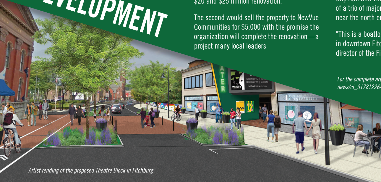
Artist rendering of the proposed Theatre Block in Fitchburg