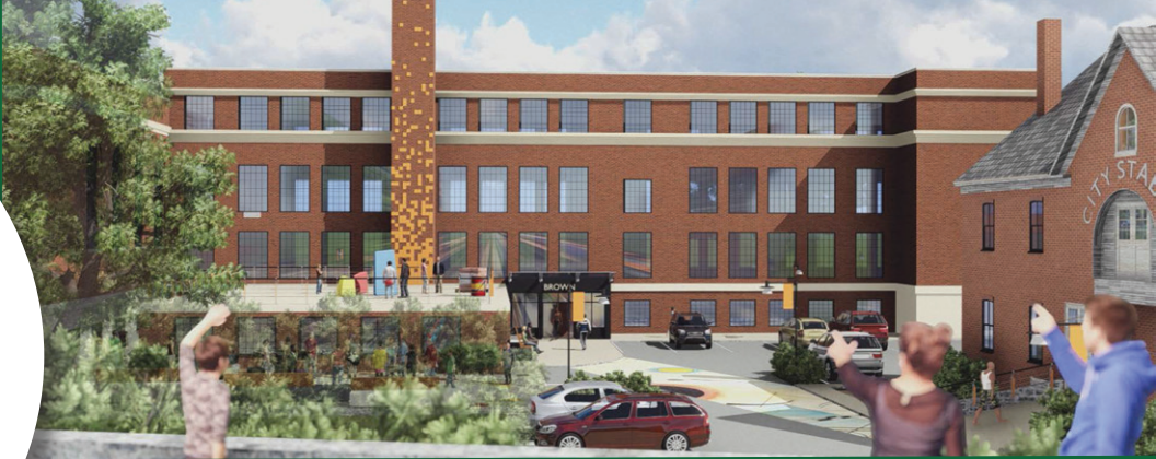
Artist rendering of B.F. Brown School, part of the proposed 'Fitchburg Arts Community'

There are four critical pieces to our vision— Community Organizing, Homeownership, Development and Small Businesses —to reimagining North of Main. Our plans include leveraging the neighborhood's rich arts, education and cultural resources.