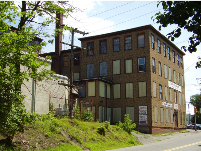
142 Water Street Leominster 2011