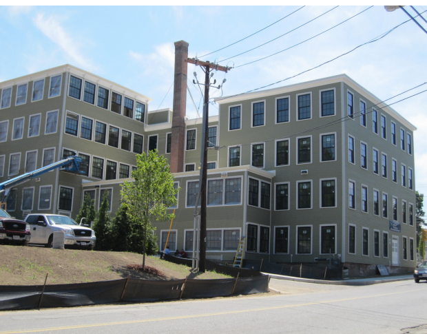
142 Water Street Leominster 2012

The Twin Cities Community Development Corporation was founded in 1979. Our holistic approach to stabilizing neighborhoods includes: